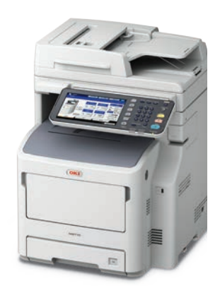
MB770 – Up to 55 ppm; 630-sheet standard paper capacity, upgradable to 3,160 sheets; 20-sheet convenience stapler